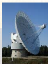
Algonquin Park radio-telescope

The extension of the geodetic reference frame into space also brought along the requirement for monitoring the Earth's orientation in space which is provided by observations of quasars with Very Long Baseline Interferometry (VLBI) .